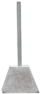
2' x 2' x 6'