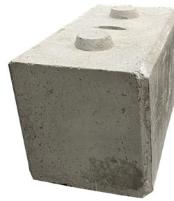
Base 30" x 30" x 60" Cap 12" x 30" x 60"