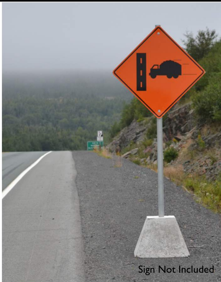
Sign Not Included